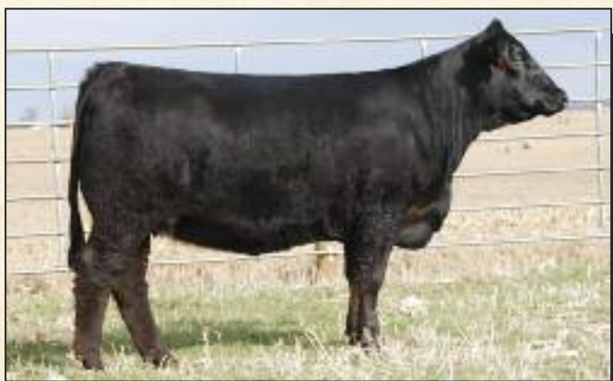
Lot 14 – Northland Miss 906G

AI Bred Capitalist 5/14/20; Due 2/18/21. This attractive Blaze Face "Santana" heifer is about as feminine as they come and made to order for a mating with "Capitalist" - expect a good one!