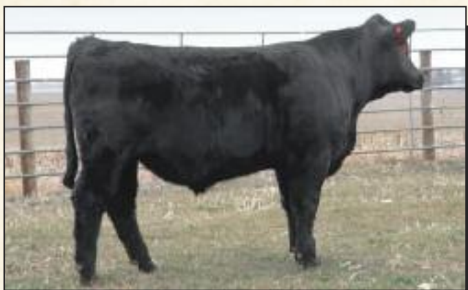
Lot 37 – Northland Agent 007H

One of the very few sons of the immortal "Shear Force" to sell anywhere and a good one at that. This full figured Bull is an own son of one of the most accomplished cows in our program. 043H is a maternal brother to "Northland Command" who is the sire of a number of cattle in this sale. Three maternal sisters remain in our program.