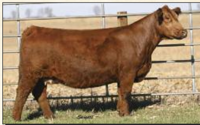
Lot 2A – Northland Miss 616D

AI Bred HPF Optimizer 6/9/20; Due 3/13/21. The only RED one in the sale and what a cow she is! Pacemaker females are the backbone of this program, and we have not sold one since 2009! A "Beautiful Bred" Optimizer daughter sells as Lot 2B, Dam sells as Lot 2, and a Main Frame daughter stays in the Herd.