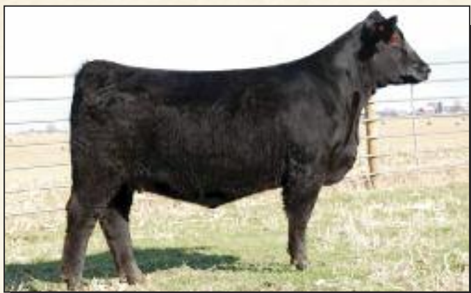
Lot 12 – Northland Miss 926G