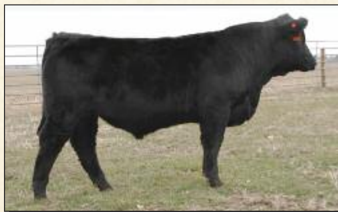
Lot 26 – Northland Lincoln 016H

This attractive purebred "Top Grade" son is clean in his front, straight topped and thick. Nothing unusual for this cow family - we've sold maternal brothers of "Lincoln" off our Bull Test in each of the last three years!