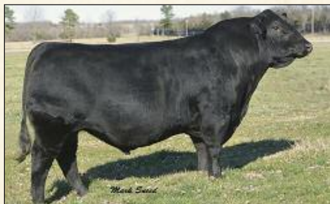
S D S Graduate – Sire of Lot 17

AI Bred W/C Lock Down 5/14/20; Due 2/18/21. "Graduate" females are known to be great producers and this gal's "Bismarck" Dam has also been a great producer. A maternal brother sells as Lot 28. All set for a "Lock Down" calf two weeks after the sale.