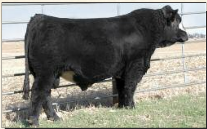
Lot 20 – Northland Command 937G