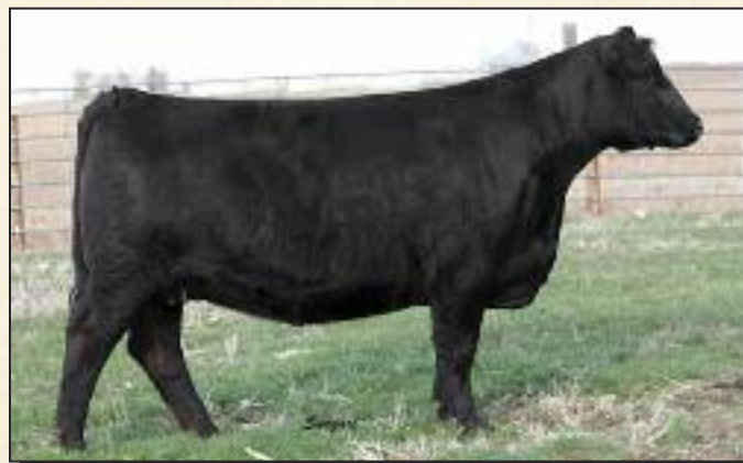
Lot 3A – Northland Miss 709E

AI Bred W/C Lock Down 5/21/20; Due 2/25/21. Here is a great young Bismarck daughter out of a top Upgrade female selling as Lot 3. Can't say it enough - Bismarck females are great property and becoming hard to find. All set for an early double bred Halfblood by "Lock Down"!