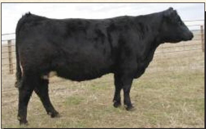
Lot 4B – Northland Miss 401B

AI Bred Capitalist 5/14/20; Due 2/18/21. Another beautiful Blaze Face "Command" daughter! 941G is steeped in maternal excellence on both sides of the aisle. An early spring calf by the Angus legend "Capitalist" should only extend the success of this special cow family! Dam sells as Lot 4.