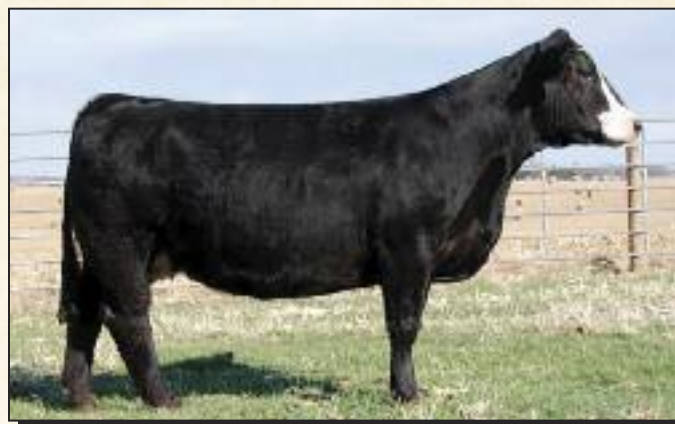
Lot 41 – Northland Miss 563C

AI Bred Capitalist 5/13/20; Due 2/27/21. This Blaze Face "Command" daughter is big and broody with a gorgeous front end. Her 2020 "Yellowstone" daughter posted a weaning ratio of 115 and stays in our program. Three maternal sisters also remain in the Herd.