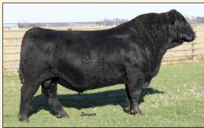
Northland TEN – Service Sire to Lots 18 and 19

PE to Northland TEN 5/14/20-9/10/20; Due Approx. 3/8/21. "Command" daughters make great production cows. This gal is big and broody like her Dam and Grand Dam. We think combining her make up with "TEN" will result in a very useful 3/4 blood. Grand Dam sells as Lot 53.