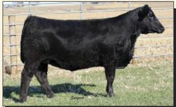
Lot 5B – Northland Miss 920G

AI Bred Capitalist 5/14/20; Due 2/18/21. How can you not like this "Beacon" daughter - deep ribbed, nice fronted, and soft made. Combine that with the proven power of "Capitalist" for exceptional SimAngus genetics! Dam sells as Lot 5A, Grand Dam sells as Lot 5.