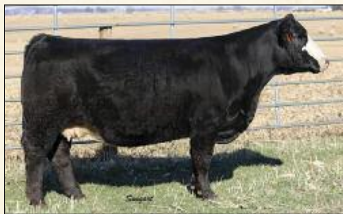
Lot 51 – Northland Miss 553C

AI Bred Hooks Beacon 5/23/20; PE Northland Main Frame 5/24/20-8/20/20; Due as early as 2/28/21, Too close to call. Here's a soft made yet attractive Blaze Face "Command" daughter that is easy to keep. A "Bismarck" son sold off our 2018 Bull Test, and a baldy "Main Frame" daughter stays at home. Whether it's "Beacon" or "Main Frame" it should be a good one.