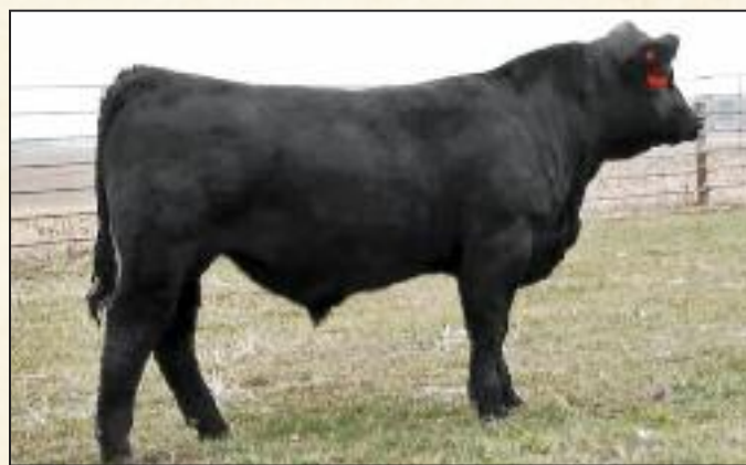
Lot 33 – Northland Beacon 032H

032H is out of one of our most powerful "Top Grade" cows and has all the pieces to make for a great Herdsire, including the highest API in the sale at 166! A good full brother sold off our Bull Test in 2020.