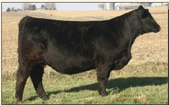
Daughter of Lot 49 – Sold in 2018

PE to Northland Loadstar 6/6/20-9/2/20; Due Approx. 4/2/21. A constant producer of useful females. We sold "Command" daughters in our "Beautiful Breds" sales in both 2018 & 2019. A terrific "Revenue" daughter remains in the Herd and her "Optimizer" son sells as Lot 34. Expect a good "Loadstar" in early April!