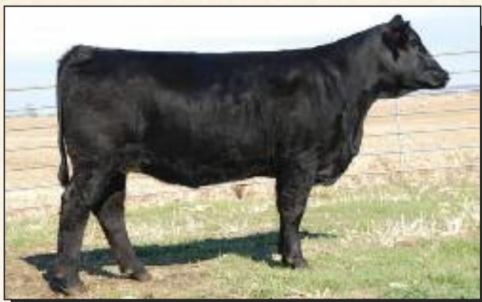
Lot 3B – Northland Miss 909G