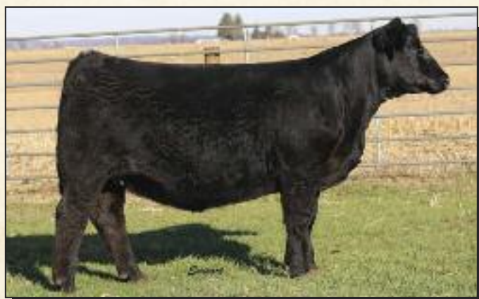
Lot 1A – Northland Miss 969G