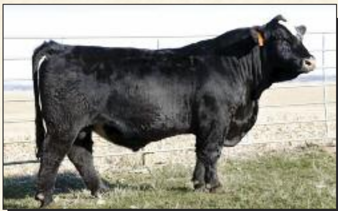
Northland Loadstar – Service Sire of Lot 54