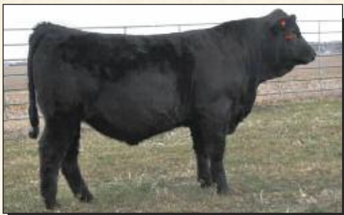
Lot 36 – Northland Force 043H