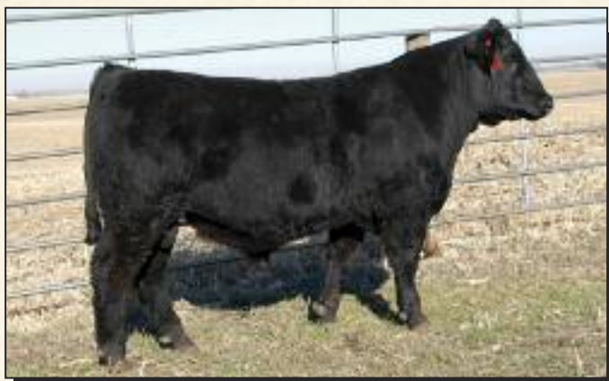
Lot 28 – Northland Boulder 019H