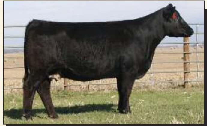
Lot 5A – Northland Miss 610D

AI Bred CDI Innovator 5/16/20; Due 2/20/21 Top Grade X Shear Force has been one of our most successful matings, and 610D is proof of that. An impressive "Beacon" daughter sells as Lot 5B, her productive Dam sells as Lot 5, and a good "Bismarck" daughter remains in our program. An exciting "Innovator" will soon be here!