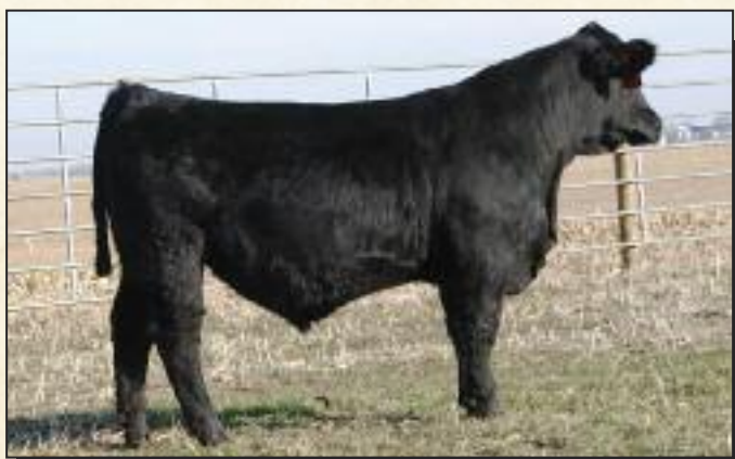
Lot 30 – Northland Beacon 065H

This "Main Frame" son is the complete package - a bit more stature than some of his pen mates, but he has the middle and muscle to go with it. If you need a bull with more frame to cover mature cows, 053H is a good choice.