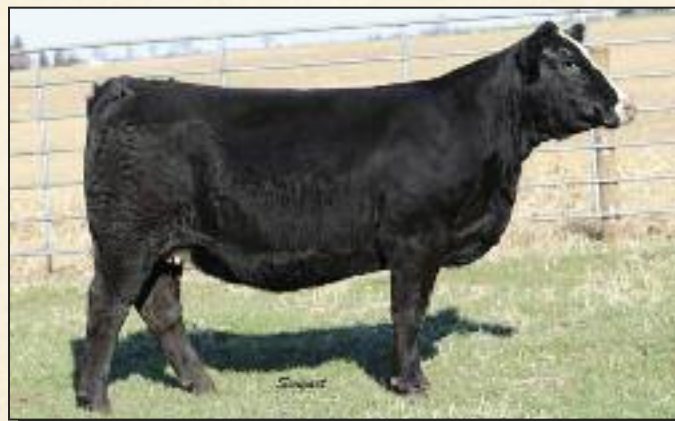
Lot 11 – Northland Miss 954G

AI Bred Capitalist 5/13/20; Due 2/17/21. This Blaze Face "Pacer" daughter just flat out looks maternal - she is deep sided and very angular through her front. Her sire has a big foot and is one of the soundest, easiest moving Herdsires we've had. "Capitalist" should really work on this beauty!