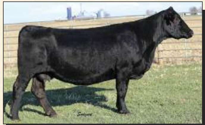
Lot 6 – Northland Miss 403B

AI Bred Capitalist 6/4/20; Due 3/8/21. 403B draws maternal power from both sides of her pedigree. A wonderful "Santa Fe" daughter sells as Lot 6A, two "Capitalist" daughters stay in our program, and a maternal sister sells as Lot 47. You are sure to like her "Capitalist" calf coming in early March!