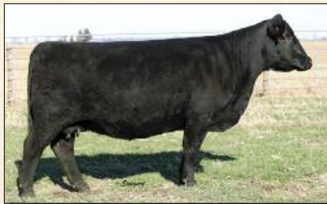
Lot 44 – Northland Miss 516C

PE to Northland Titan 6/6/20-10/1/20; Due Approx. 3/29/21. An attractive Halfblood by "Sharper Image" and going back to "Traveler" on the bottom side. A nice "TEN" daughter stays in our program. 516C is set to calve the end of March to our powerful new SimAngus Herdsire, "Titan".