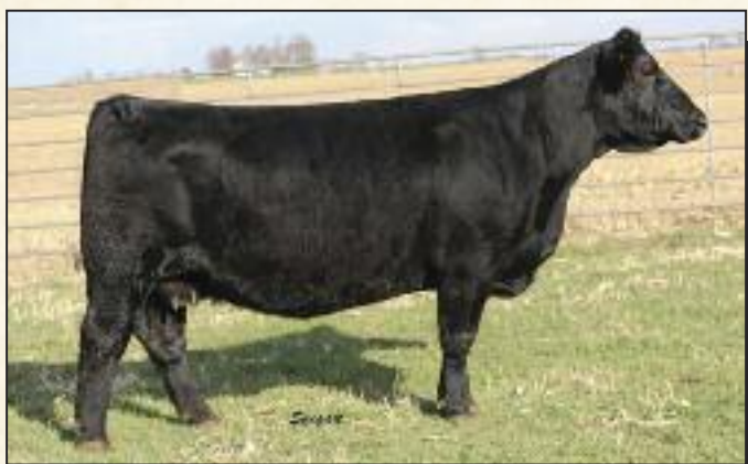
Lot 4 – Northland Miss 201Z

PE to Northland TEN 5/14/20-9/10/20; Due Approx. 3/12/21. This "Beacon" daughter stems from our most dominant cow family and writes a terrific set of numbers. Expect a really good 3/4 blood by "TEN" in March!