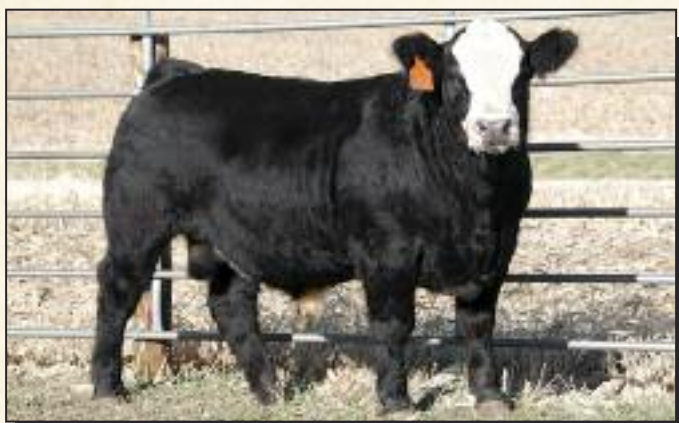
Lot 21 – Northland Blaster 048H

A powerhouse from end to end - this guy is deep gutted, wide based and thick! He is also good on the move and puts down a big foot. A twin brother sold off our 2020 Bull Test. A two year old, 937G will be big enough to cover those larger frame mature cows.