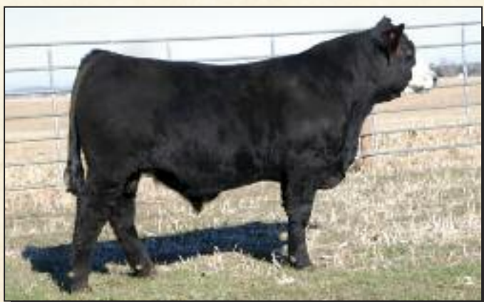
Lot 22 – Northland Facetime 014H

Simply one of the very best Bulls this program has produced. From any angle, "Blaster" is deep, thick, and wide based. Ratioing 106 at weaning, he is extremely well balanced and comes with an excellent disposition. That's a lot of breeding value packed into one great individual!