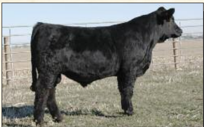
Lot 1 – Northland Mainframe 053H

Easy to be drawn to this "Boulder" son, he has a clean extended front end, big middle, and exceptional muscle expression. Out of a good "Bismarck" cow and a great cow family.