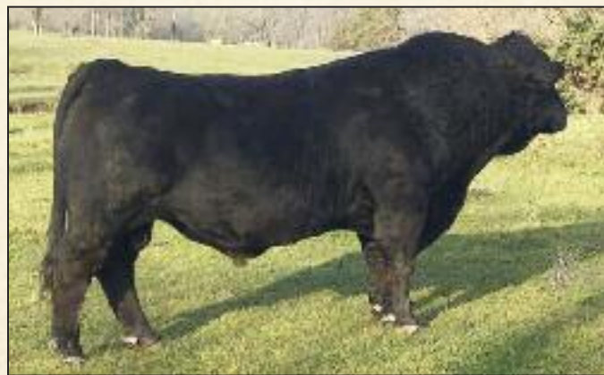
Northland Mainframe – Sire of Lot 19

PE to Northland TEN 5/15/20-9/10/20; Due Approx. 3/30/21. This Star Face Heifer is long spined and feminine like her Dam and draws maternal influence from her sire. Expect a good 3/4 blood by "TEN" late March or early April.