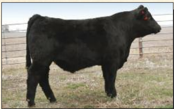
Lot 23 – Northland Boulder 009H

"Facetime" is just outstanding and has been a farm favorite all summer long. He really covers all the bases, combining a depth of rib and muscle with a clean front and an easy stride. "Facetime" offers a genetic package from which to build a program!