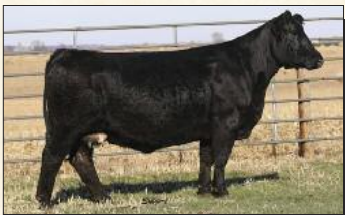
Lot 1 – Northland Miss 444B