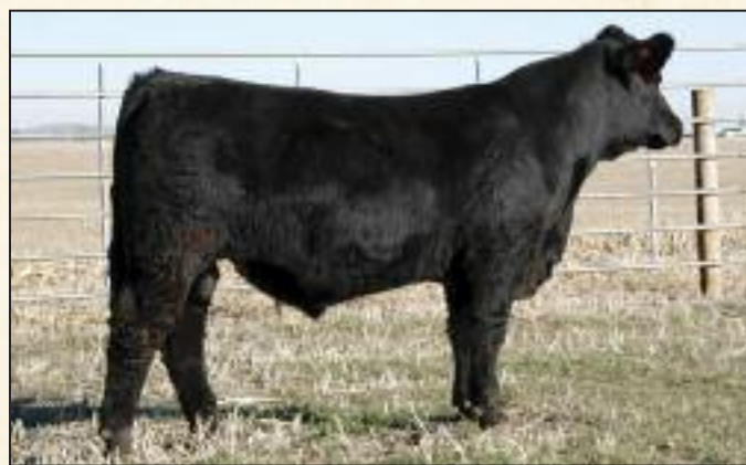
Lot 25 – Northland Optimizer 031H

A high performing Blaze Face "Optimizer" out of another productive "Top Grade" cow. Loaded with muscle and capacity - indexed 111 for weaning! A full brother sold off our Bull Test just last year.