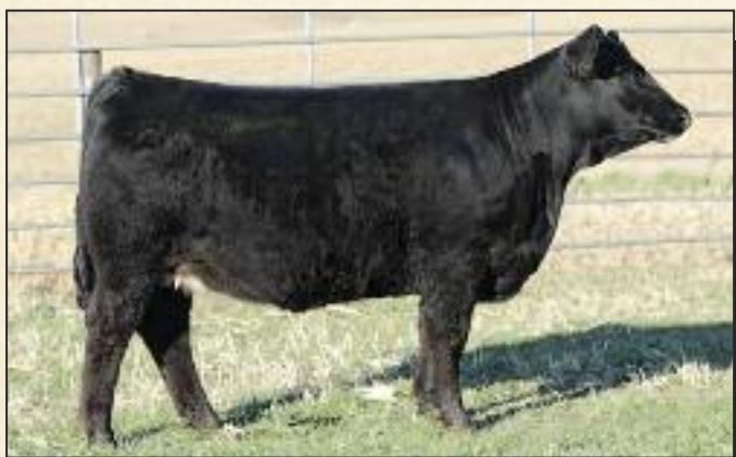
Lot 15 – Northland Miss 939G

AI Bred Capitalist 5/14/20; Due 2/18/21. This gal's Dam is one of the top producing young cows in our program. A full Brother to 906G sells as Lot 34, and her Grand Dam sells as Lot 49. Get ready for a "Capitalist" in a couple weeks.