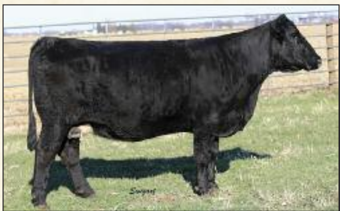
Lot 7 – Northland Miss 354A

AI Bred Capitalist 5/13/20; Due 2/17/21. Analyze this female from any angle - you'll find she is deep ribbed, feminine in her front, soft-made, and totally balanced! Add to that a calf by "Capitalist" coming very soon, and you have a fabulous female with a great future! Dam sells as Lot 6.