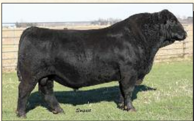
Northland TEN – Sire of Lots 38 and 39

Couldn't resist the name! This "Capitalist" son borrows length of side and front end extension from his young "Yellowstone" Dam. He is super correct and offers a touch more stature without sacrificing calving ease.