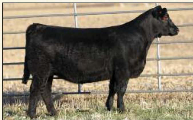
Lot 9 – Northland Miss 904G

AI Bred W/C Lock Down 5/14/20; Due 2/18/21. Absolutely a Farm favorite! "Bismarck" commands respect and admiration across the industry because he sires cattle that look like this. Moderate in size, sweet fronted, and perfectly balanced, this gal sells all set for an early spring calf by "Lock Down"!