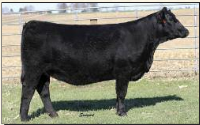
Lot 6A – Northland Miss 930G