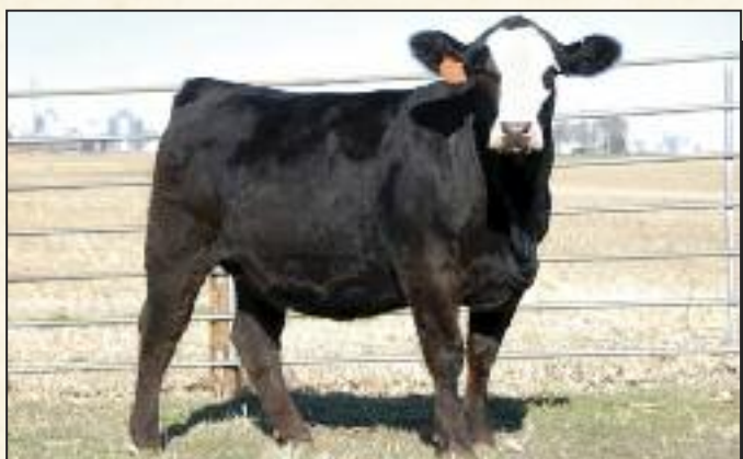
Lot 13 – Northland Miss 947G

AI Bred Capitalist 5/14/20; Due 2/18/21. 926G stems from one of our most accomplished cow families. Her Grand Dam is the Dam of "Northland Command," whose influence has been significant in our program. Her Dam is also the Dam of "Northland Santana" - a tremendous "Santa Fe" son and sire of Lot 13. 926G sells ready to calve to "Capitalist" soon after the sale.