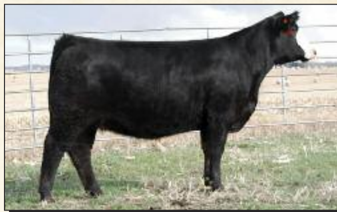
Lot 8 – Northland Miss 913G

PE to Northland TEN 5/15/20-9/10/20; Due Approx. 3/8/21. A very special "Bismarck" daughter. There are not, and will not be, many more "Bismarck" daughters available hence forth. This Lady projects a falwless phenotype with the signature Blaze Face - her possibilities are endless! Selling bred to our stellar SimAngus Herdsire "TEN". Expect something special in early March!