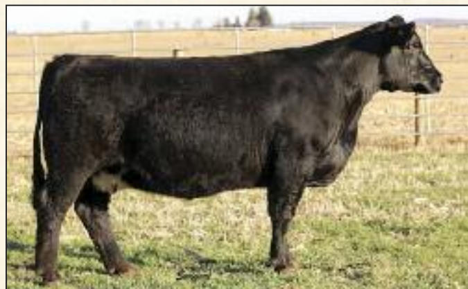
Lot 42 – Northland Miss 438B

AI Bred Yellowstone 5/18/20; Due 2/23/21. Every good cow has a good mother and is that ever true here. This gal's Dam is "Northland Miss 422P", the Dam of our accomplished Herdsire "Pacemaker" and long time Donor. All set for a "Yellowstone" in early Spring.