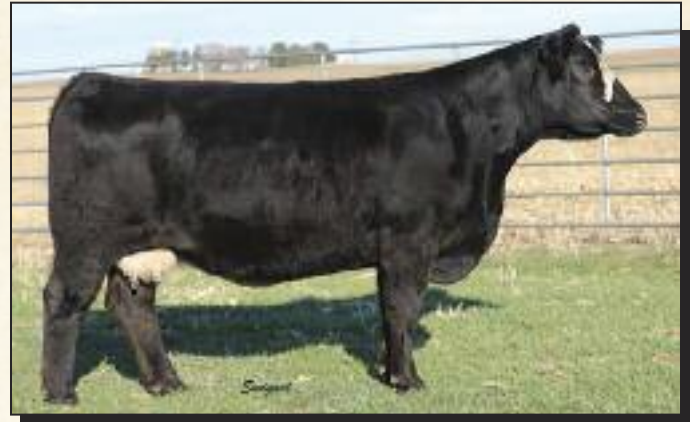
Lot 5 – Northland Miss 421B

AI Bred Capitalist 6/9/20; Due 3/13/21. 421B inherits a lot of power and production from her robust Dam sired by "Joker". A productive "Top Grade" daughter sells as Lot 5A. A "Yellowstone" daughter sold in our 2019 "Beautiful Breds" Bred Heifer Sale, and a stylish "Command" daughter will stay in the herd. She sells safe to the late and legendary "Capitalist"!