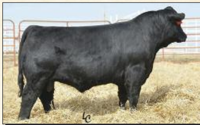
Hook's Yellowstone – Sire of Lot 50

AI Bred HPF Optimizer 6/5/20; Due 3/9/21. This no nonsense "Yellowstone" daughter comes to the sale bred to the proven power bull, "Optimizer". Her "Top Grade" Dam has become a true matron of our Herd. 613D leaves three maternal sisters in the program.