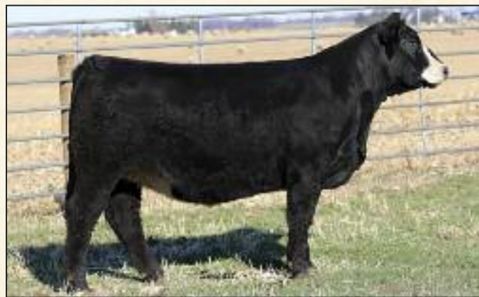
Lot 2B – Northland Miss 921G

PE to Northland TEN 5/15/20-8/20/20; Due Approx. 3/30/21. It's not hard to see both Dam and Grand Dam in this robust Blaze Face Optimizer. Expect a really good 3/4 blood by "TEN" later this spring.