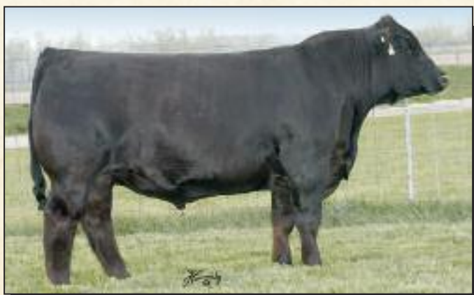
MCM Top Grade – Sire of Lot 7A

AI Bred HPF Optimizer 5/16/20; Due 2/21/21. A super attractive "Shear Force" daughter - really well balanced with a beautiful front end. Her Bred Heifer daughter, who looks just like her, sells as Lot 57, and a productive "Top Grade" daughter sells as Lot 7A. Coming soon with another "Optimizer"!