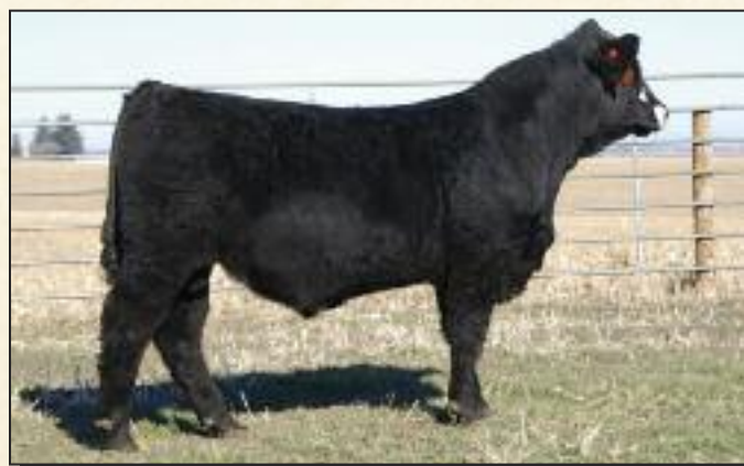
Lot 35 – Northland Optimizer 026H

An upstanding Blaze Face son of the power Bull, "Optimizer". Level topped, long geared and well muscled, 026H will sire performance with style! A full sister sells as Lot 14.