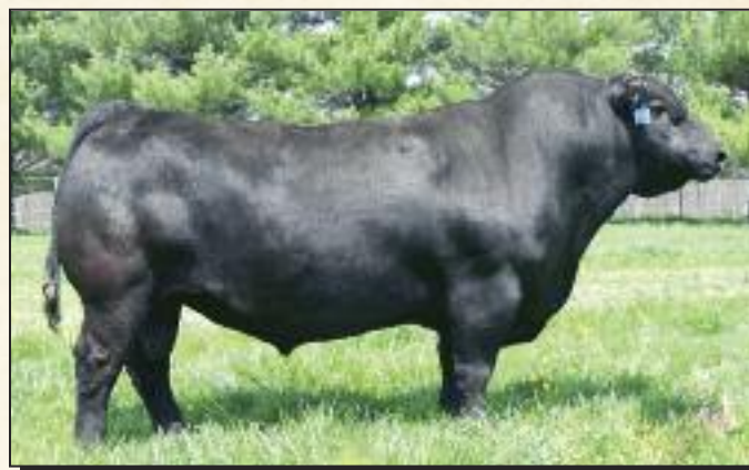
LD Capitalist – Service Sire of Lot 16

AI Bred LD Capitalist 5/14/20; Due 2/18/21. Very similar in type and kind to her Full Sister selling as Lot 15. Like her sister, she is moderate in frame, easy to keep, and loaded with maternal potential.