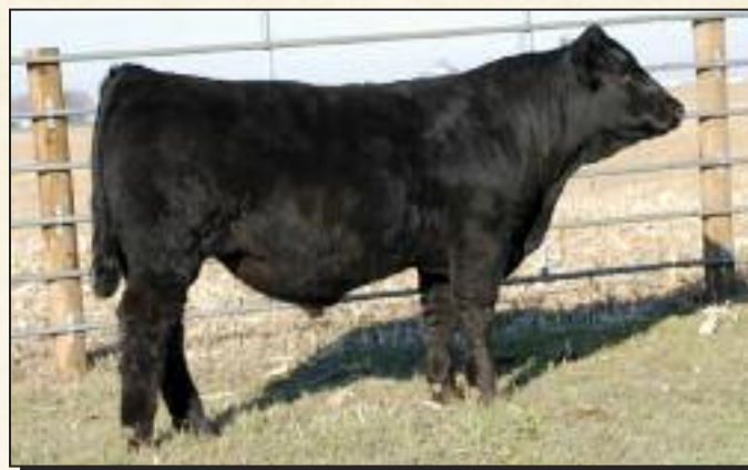
Lot 24 – Northland Optimizer 037H

A double bred 3/4 blood out of one of our best "Top Grade" daughters. This bull is super thick and really well balanced, ratioing 104 at weaning.