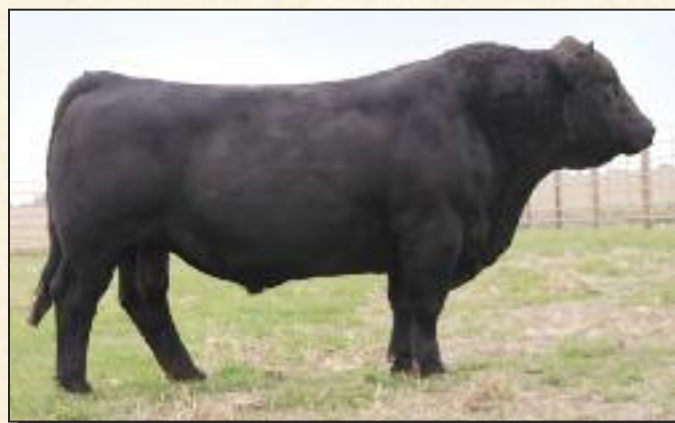
Northland Pacer – Service Sire to Lot 43

PE to Northland Pacer 6/5/20-9/30/20; Due Approx. 4/20/21. A good "Command" daughter out of one of our best "Shear Force" cows. A really nice "Bismarck" daughter sold in our 2018 "Beautiful Breds" Bred Heifer Sale and a good "Santa Fe" son sold off our 2019 Bull Test.