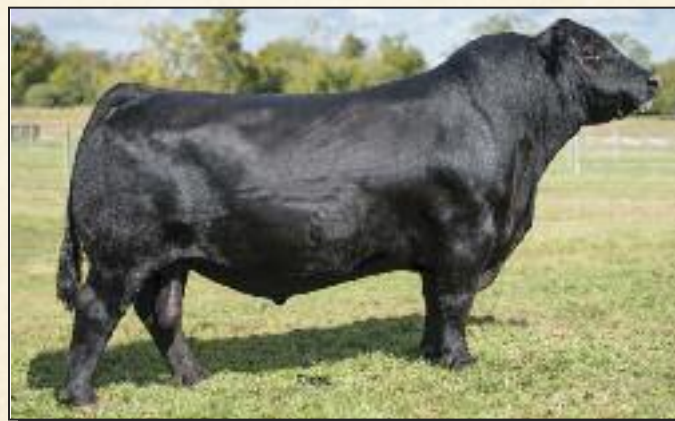
Connealy Capitalist 028 – Sire of Lot 35

A Star Face and robust son of the great "Capitalist", this bull is loaded with meat and capacity. 023H is a good choice for calving ease. His attractive Dam sells as Lot 47.