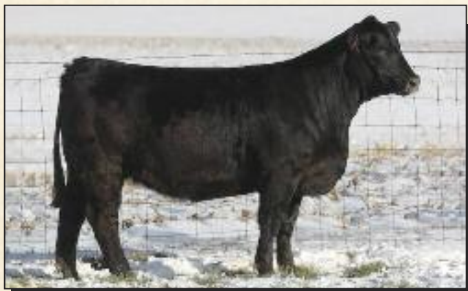
Daughter of Lot 49 – Sold in 2019