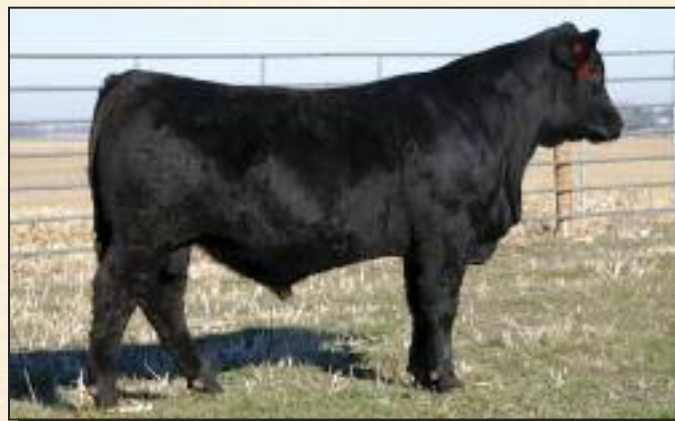
Lot 27 – Northland Capitalist 044H

A "no holes" top to bottom, end to end, solid SimAngus Bull! A maternal brother sold off our 2019 Bull Test. This "Capitalist" son really hits the Sweet Spot!