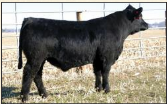
Lot 31 – Northland Boulder 039H

Here's a good "Beacon" son out of a really good "UpGrade" cow whose full sister sells as Lot 3. 065H is big in the middle, well muscled and should offer great calving ease.