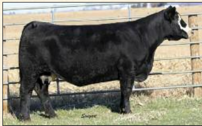
Lot 53 – Northland Miss 114Y

PE to Northland Pacer 5/23/20-9/30/20; Due Approx. 3/19/21. This big, broody "Shear Force" daughter just keeps on producing usable, marketable cattle. One daughter sold in our 2018 "Beautiful Breds" sale while three others, one by "Upgrade", one by "Command", and one by "Capitalist" remain in the Herd. Expect an outstanding March calf by "Pacer".