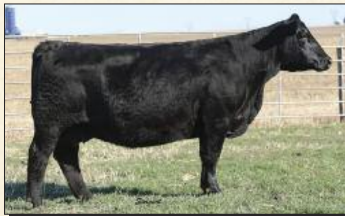
Lot 3 – Northland Miss 503C

AI Bred Hooks Beacon 5/16/20, PE to Northland Loadstar 5/16/20-9/2/20; Due Approx. 3/10/21. One of the best young producers to come out of our program. A good "Bismarck" daughter sells as Lot 3A and a Bred Heifer daughter by "Beacon" sells as Lot 3B. A terrific Beacon daughter stays at home. Possibly bred to Beacon but more probable to our powerhouse Optimizer son, "Loadstar". A Full Brother, "Main Frame", a twin sister, and three maternal sisters remain in our program.