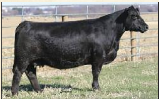
Lot 2 – Northland Miss 245Z