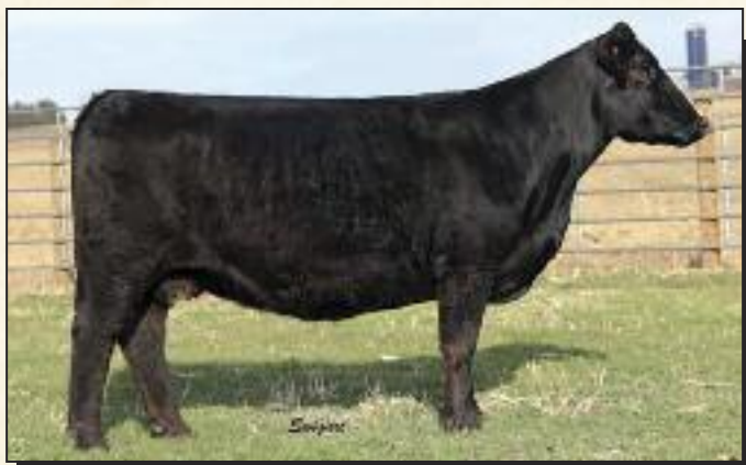
Lot 47 – Northland Miss 551C

AI Bred LD Capitalist 6/16/20; Due 3/20/21. Sired by "Northland Force", a "Shear Force" son. "Force" daughters have proven to be very competent production cows as is this one. 536C sells bred to the powerhouse "Capitalist" son, "LD Capitalist".