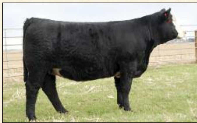
Lot 10 – Northland Miss 927G

AI Bred LD Capitalist 5/13/20; Due 2/17/21. Big bodied, soft and broody, this "Optimizer" daughter has cow power written all over her! She is backed by a strong and reliable cow family and promises an early spring calf by one of "Capitalist's" most powerful sons - "LD Capitalist".