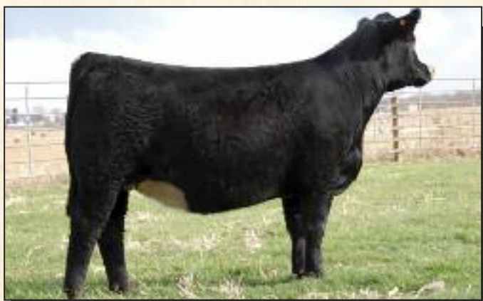
Lot 4A – Northland Miss 941G

AI Bred CDI Innovator 5/23/20; Due 2/27/21. 201Z is hard to sell; she has been a consistent seedstock producer. An "Upgrade" son sold off our Bull Test in 2019 as did a "Pacemaker" son in 2017. An impressive Top Grade daughter sells with a "Pacer" calf at side as Lot 55. A Yellowstone daughter sold in our "Beautiful Breds" Bred Heifer Sale last year, and a Bred Heifer "Command" daughter sells as Lot 4A, while her 2020 "Pacer" daughter stays at home.