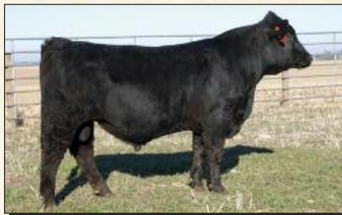
Lot 32 – Northland Beacon 001H

An outstanding son of the EPD star, "Beacon" and out of productive "Pacemaker" Dam. A maternal brother sells as Lot 20, while another maternal brother serves as our Herdsire, "Northland Loadstar". 001H is a great combination of calving ease and growth and boasts an API of 163!